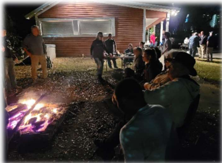
Smores by the bonfire to cap off a perfect evening.

What a great way for Freemasons to share this beautiful Carriage House and Lodge with our lovely Ladies and children.