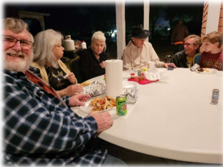
Lots of food and friends.