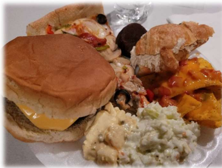
Delicious burgers, pizza, hot dogs, chicken salad croissants, wraps, sides, nachos, and desserts!