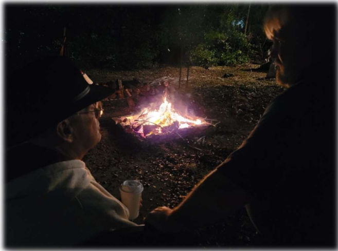
Fellowship by the fire.