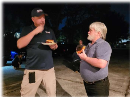
Hope to see everyone at the next great Solomon family night!