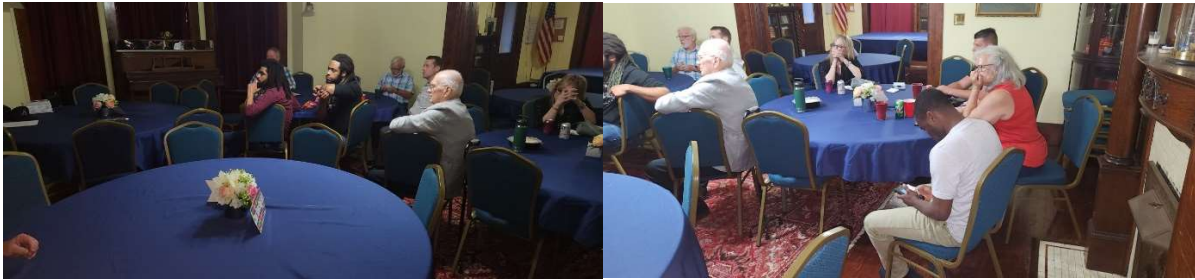
Excellent food, fellowship, and family fun at the March Family Night.